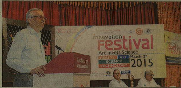
Anil Kakodkar in Mumbai on Friday.

On March 18, The Indian Express first reported that